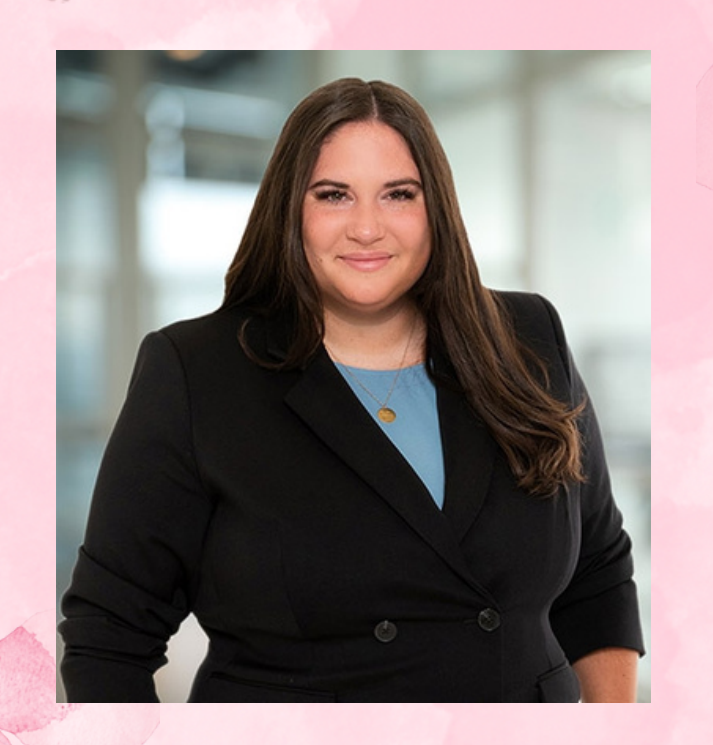
Commercial Litigation at Fox Rothschild